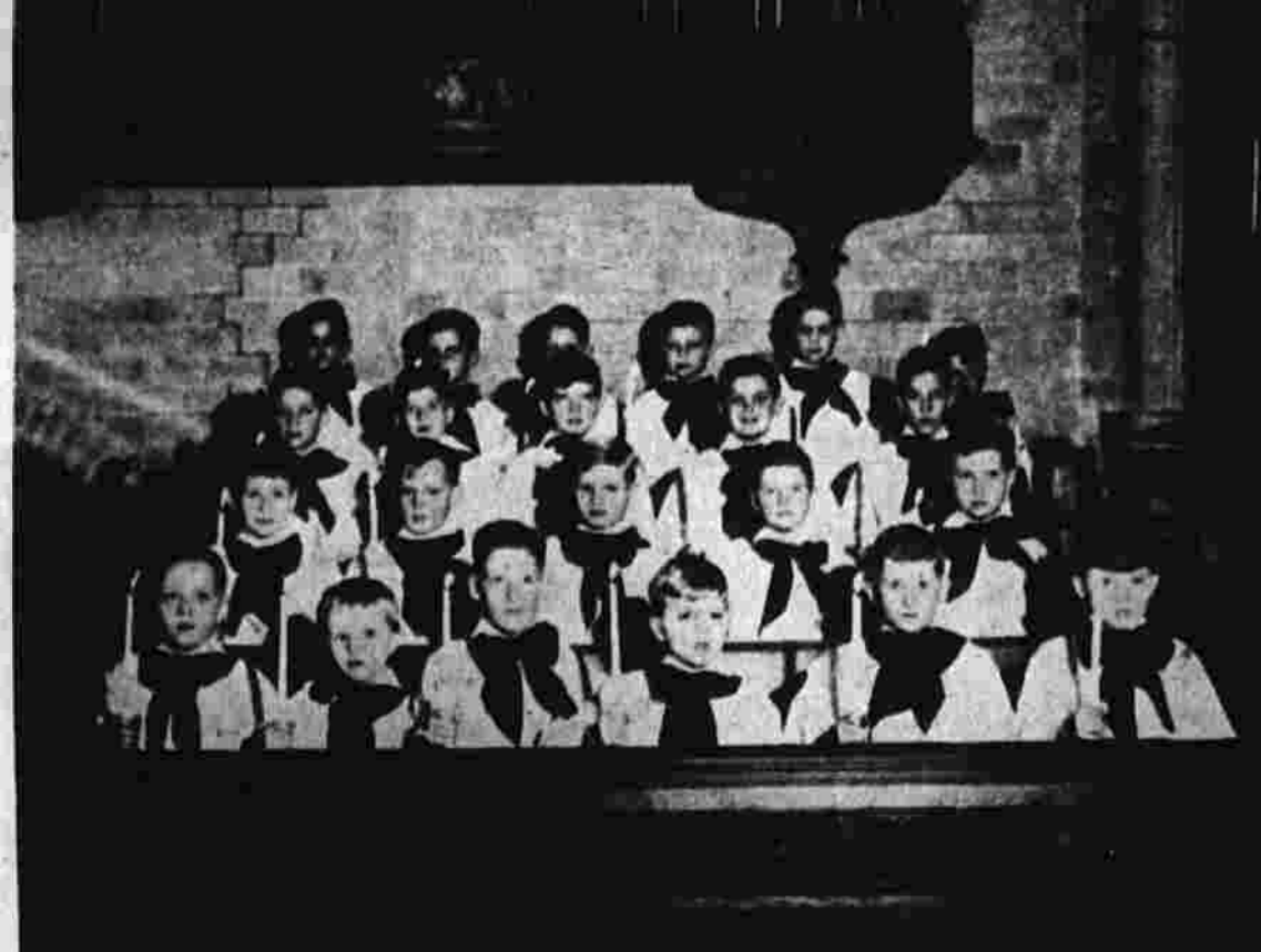
The Boys Choir of 23 voices in their full vestments pictured above will make their initial appearance at the 9:30 service, the White Gift Service, at the South Methodist church tomorrow.